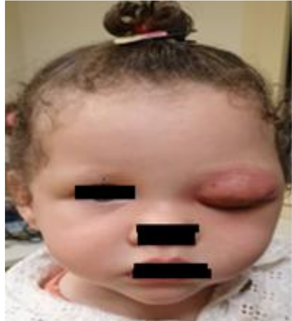
Figure 1: Clinical photography showing severe and total left eyelid ptosis (the opening of the left eye was impossible), proptosis and swelling

Considering those results, the diagnosis of orbital cellulitis stage II has been established and the child was admitted. Regarding the high risk and speed of the case evolving into cavernous sinus thrombosis, treatment should be started without delay.