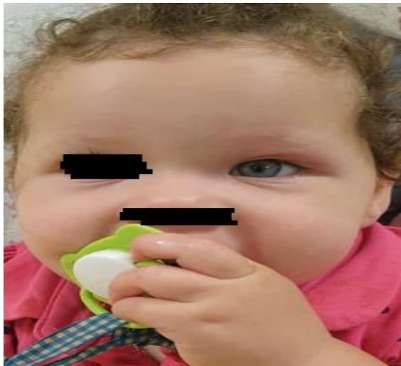
Figure 4: clinical photography on the 10th day of treatment : fully healed