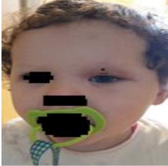
Figure 3: improvement in left eyelid swelling (the eye can easily be opened) 48hours after intravenous treatment, notice the wound scar (*) on the upper eyelid

The clinical response was rapidly favorable after 48 hours with a marked reduction of the edema and opening of the eye (fig.3). A total recovery was obtained by the 10 th day (fig.4).